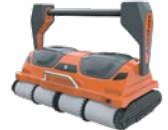
VORTRAX TRX 7700 iQ